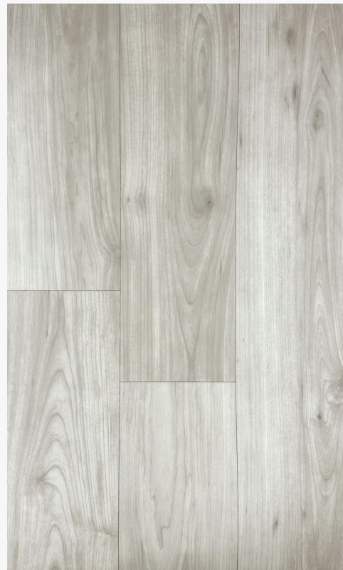
Lonwood Madera W136 Earl Gray