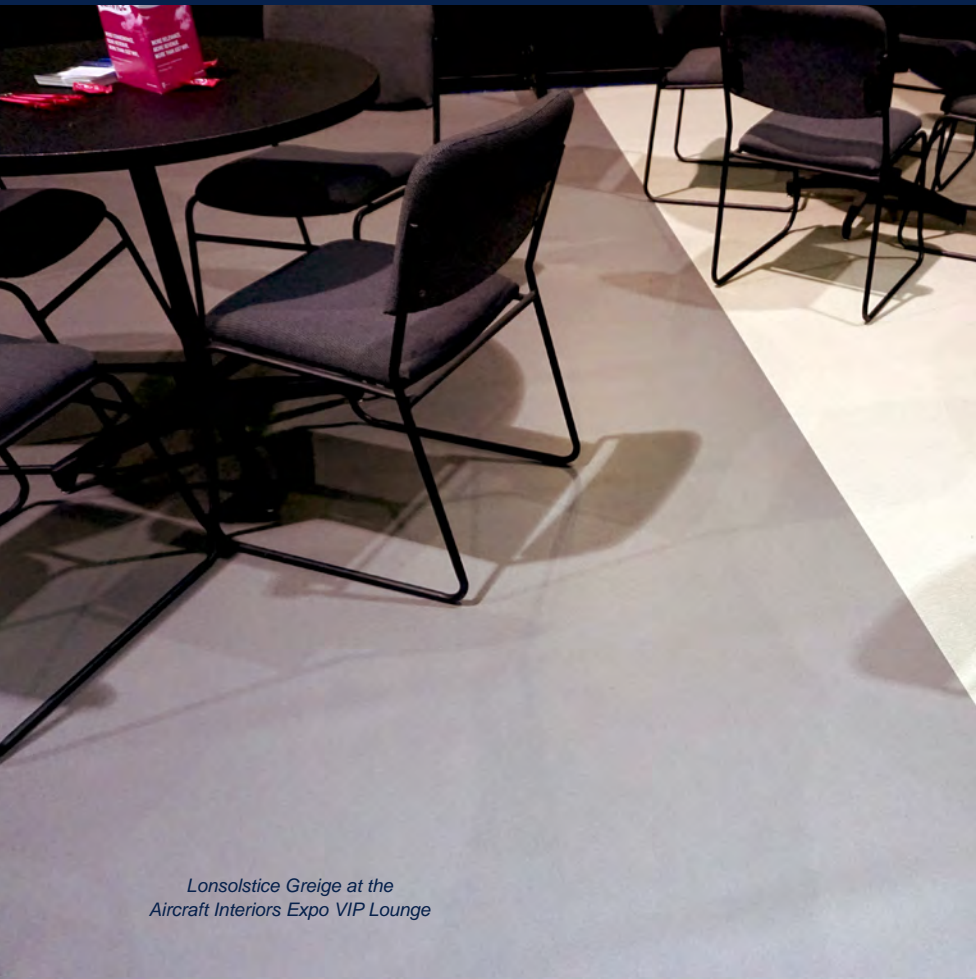
Lonsolstice Greige at the Aircraft Interiors Expo VIP Lounge