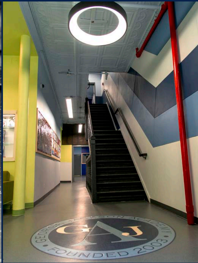
SX113 Rocky Beach