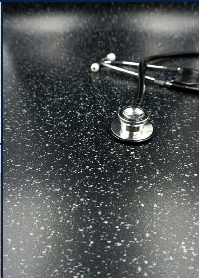
SX112 Magnetic Gray