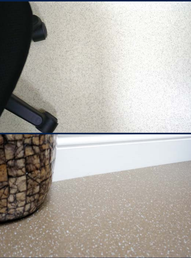
SX111 Twilight Zone