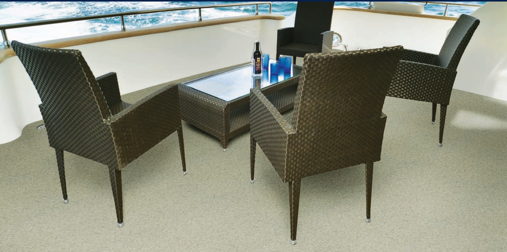
Product #: MS10 Color # Name: 10 Dorato