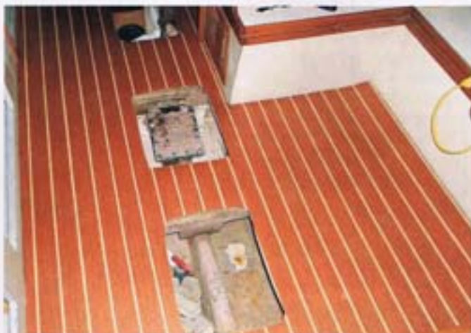
As the Lonseal material came in a large sheet, Art made a one-piece template for the saloon sole, at top, by taping poster board to a backbone of thin plywood. He laid the template on the material, at left, and used tape to transfer the shape and create a line to cut to. Roughed in, at right, the new sole fits nicely.