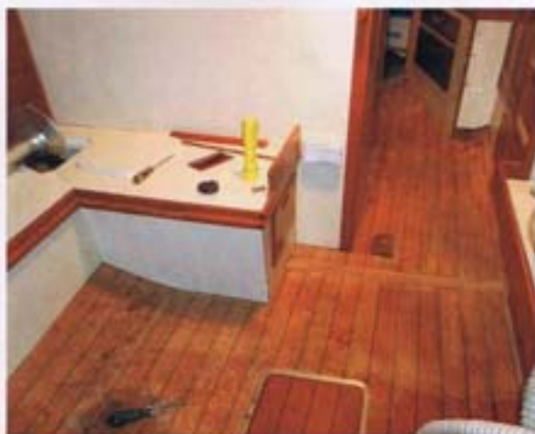
To prepare the sole for its new vinyl coverup, Art stripped the old varnish, faired the surface, and undercut the trim to allow a tidy fit.

The first step was to strip the old varnish, then fill and fair the bare wood with epoxy fairing