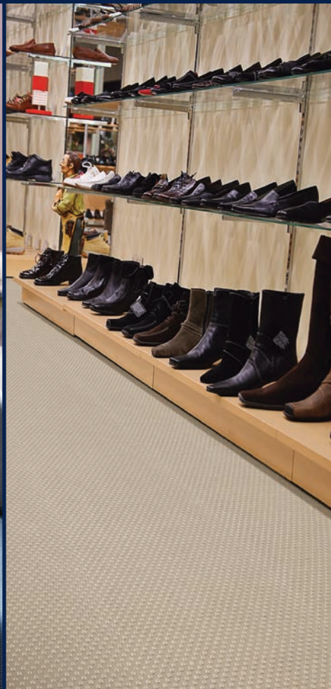
P713 Baleen Gray