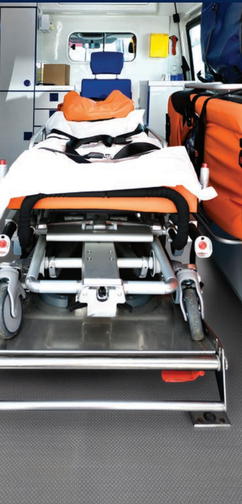
P717 Orca Blue