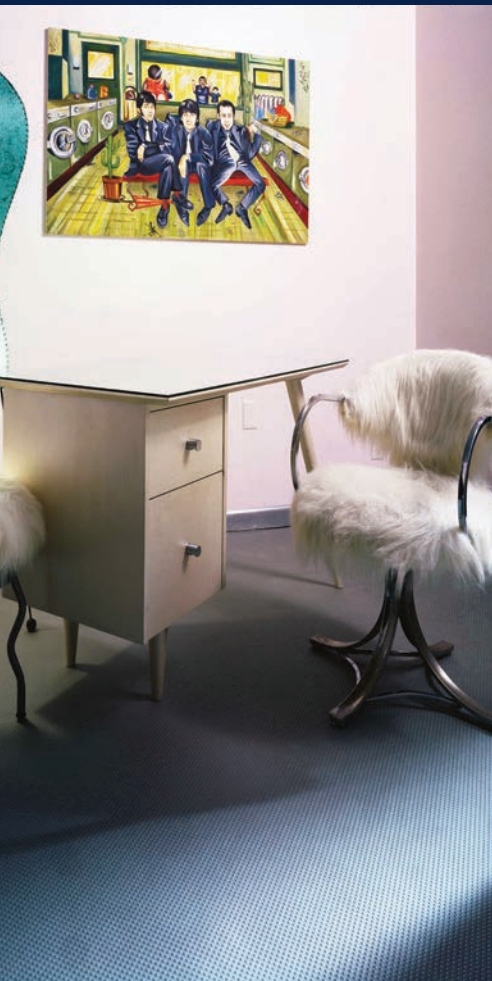
P712 Caspian Mist