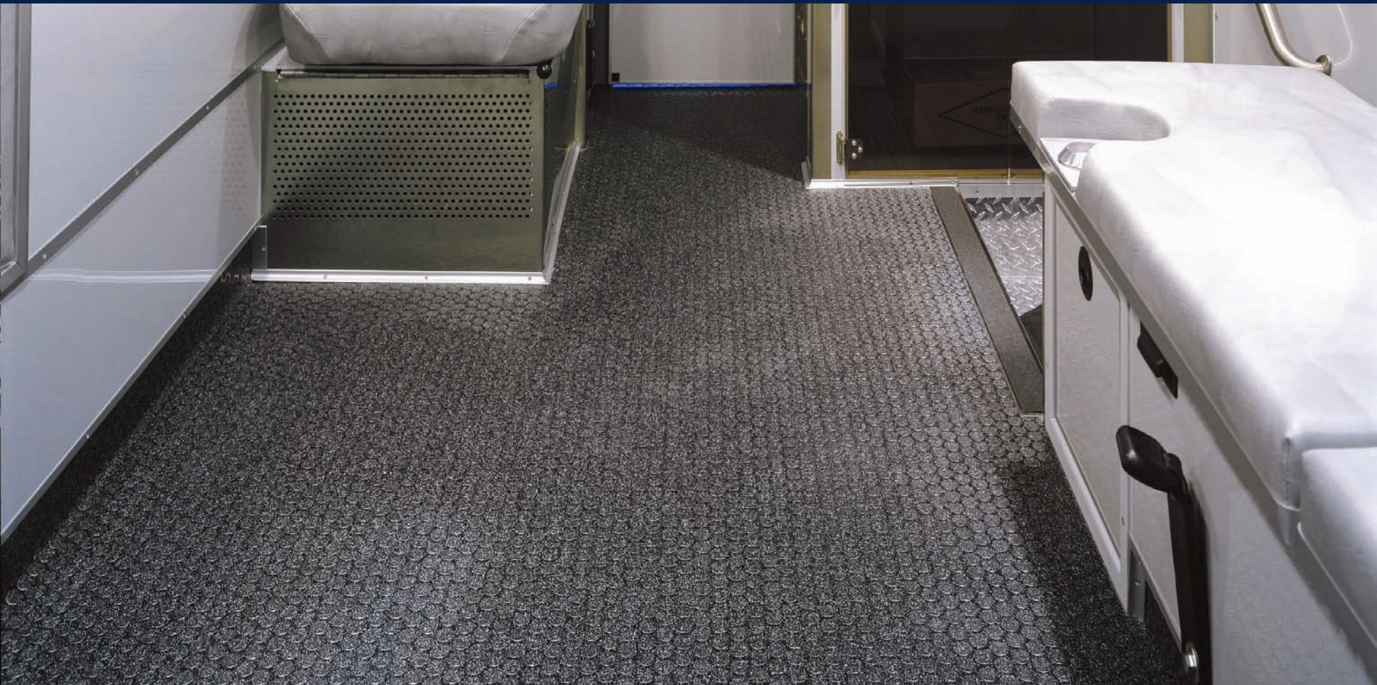
C150TS Onyx Topseal