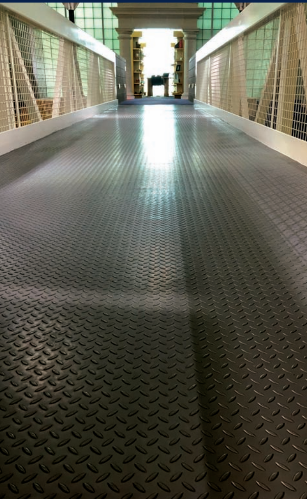
P161 Metallic Gray