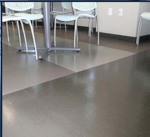
F7240 White Diamond*