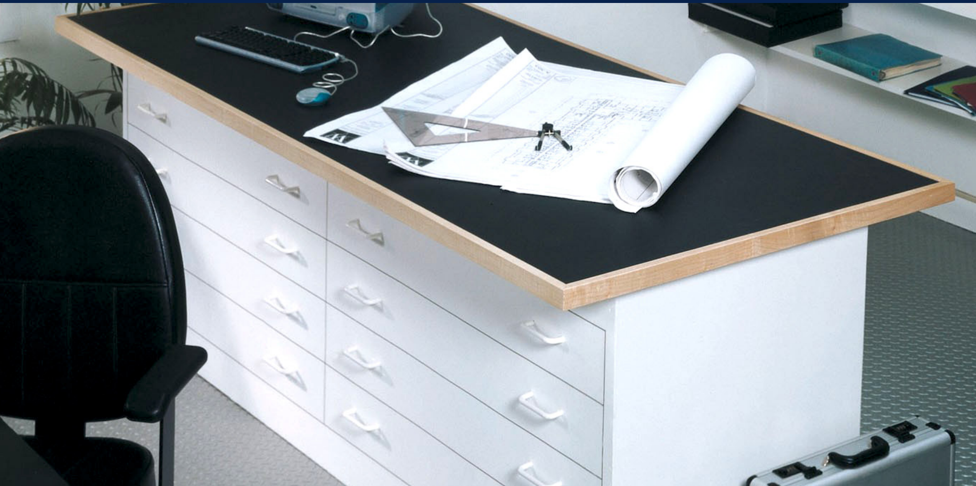
Product #: S101 Color # Name: 101 Black