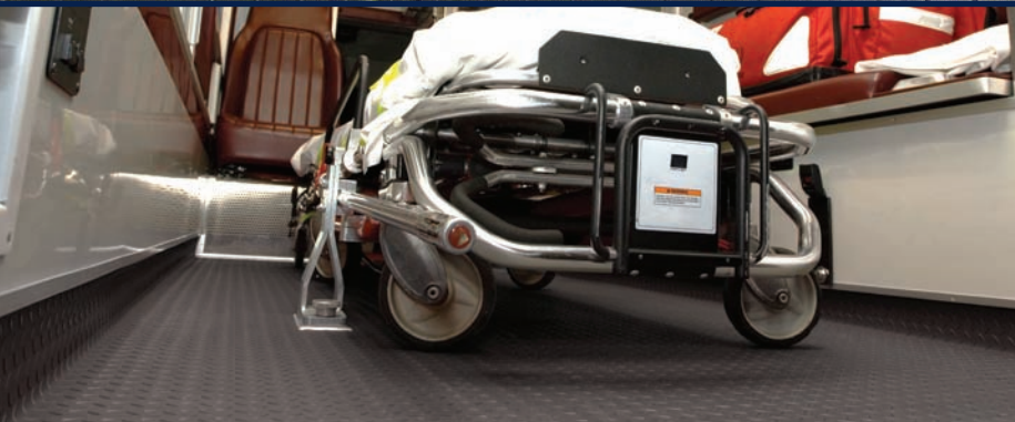
Product #: P411 Color # Name: 411 Putty