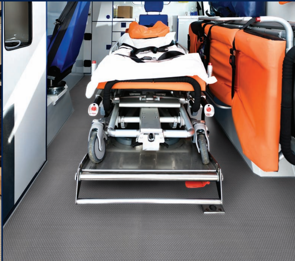
Product #: P713 Color # Name: 713 Baleen Gray