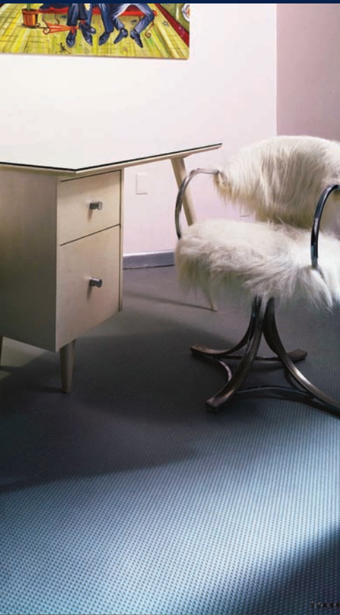
Product #: P712 Color # Name: 712 Caspian Mist