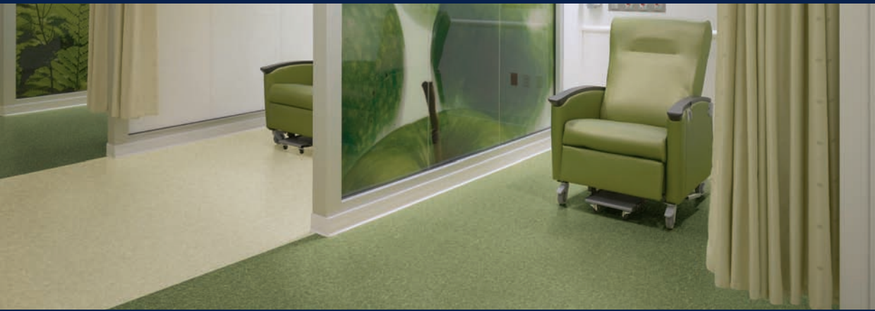
Product #: LD200 Color # Name: 200 Latte