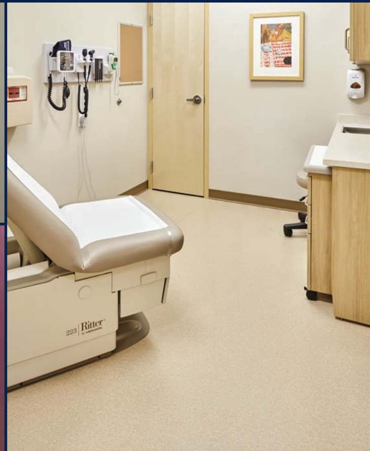
Product #: LD201 Color # Name: 201 Blanca