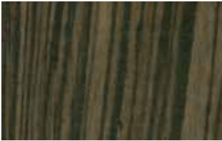
NEW! 7059 FALCON