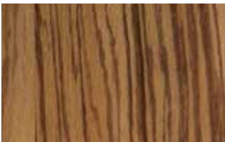
7068 AFRICAN SUNSET