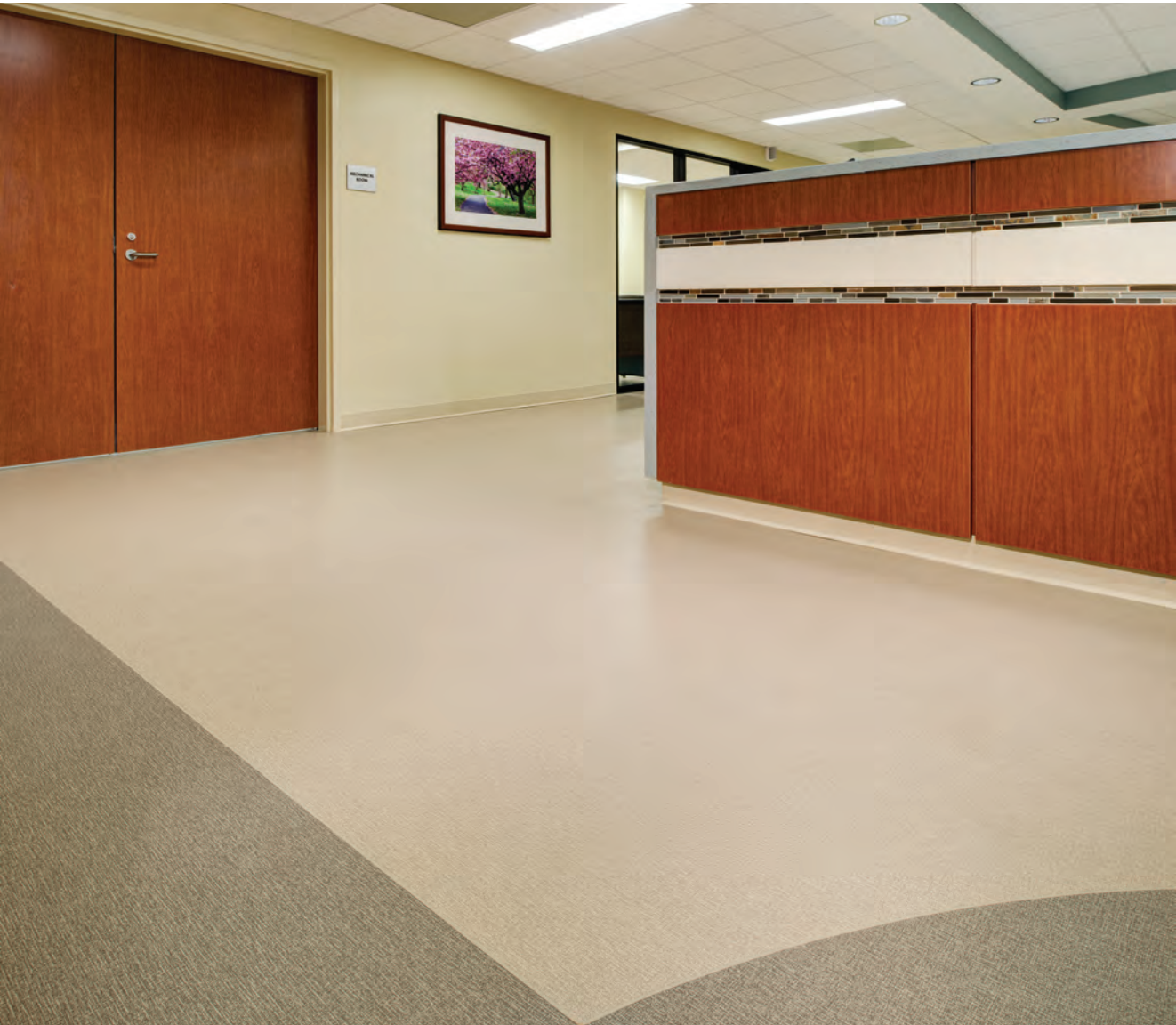
Front and back cover: Self-Regional Hospital, Greenwood, SC

Lonseal | 928 East 238th Street | Carson, California 90745 p. 310 830 7111 | 800 832 7111 | info@lonseal.com | www.lonseal.com